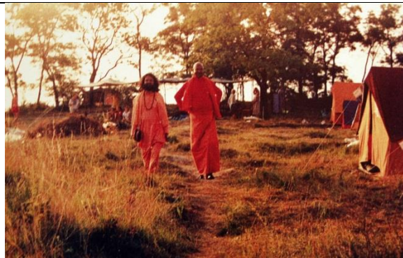
Yoga camp in Páty with Guruji and Swamiji in 1980

There were memorable summer and weekend seminars in Kétegyháza, Mezőtúr, Budapest, Érd, Százhalombatta, Debrecen, and Vép.