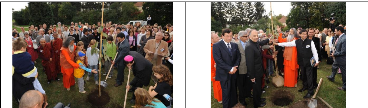
Planting a Peace Tree in October 2009 in Szombathely, with the Town Mayor and participants of the World Peace Summit

János Áder, President of Hungary invited Swamiji to an outstanding event in Hungary in 2013, the Budapest Water Summit.