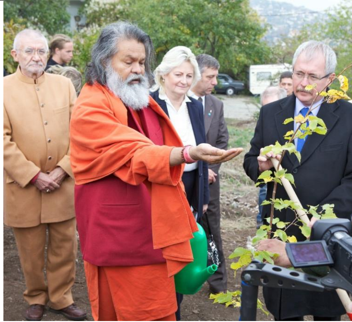
Planting of 11 Peace Trees at the Svábhegy (Duna-Ipoly National Park), Budapest, in the frame of the Budapest 2013 Water Summit: Minister of Rural Development H. E. Sándor Fazekas, Deputy Secretary of State for Water, the Director of the Park, the Head of the Department for International Relations of the Ministry of Rural Development, and the Chief Adviser of the Special Ministerial Envoy, 7 October 2013