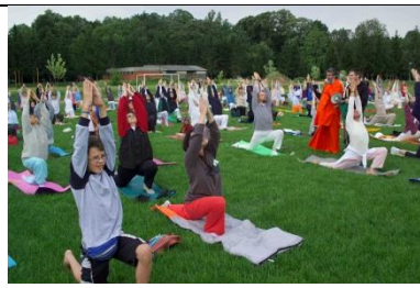
Swamiji leads open air asana practice in Vép