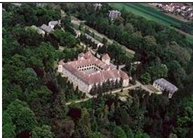
Bird's-eye view of the Vép castle