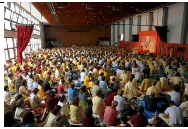
Swamiji's Satsang in great hall in Vép