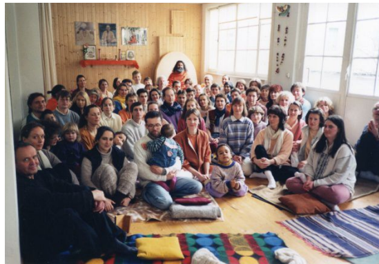
Yoga group in the first Hamburg Ashram