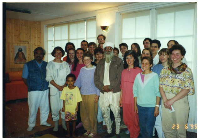
Visit to Ashram Hamburg