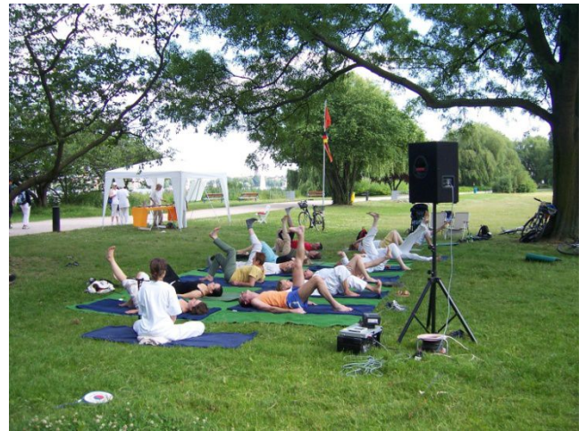
Yoga in Daily Life on the Sportsfest during the Football Cup WM in Germany 2006