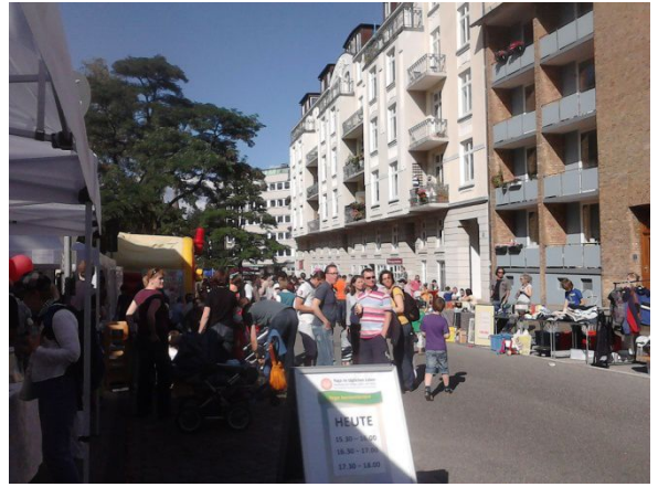
Yoga in Daily Life on one road festival