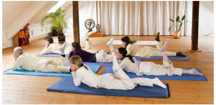
Asanas in Ashram Mühlendamm