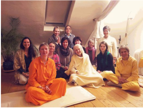
In Mühlendamm Ashram