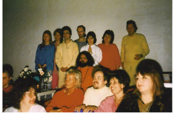
Yoga-Seminar with Swamiji at Falkenried