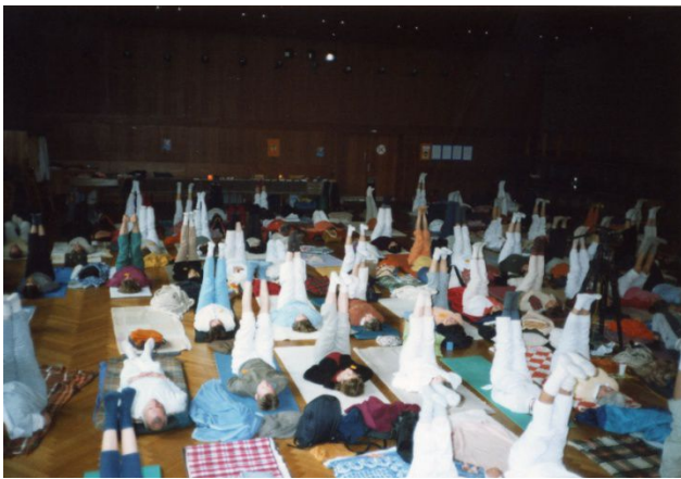
Yoga-Seminar in Hamburg