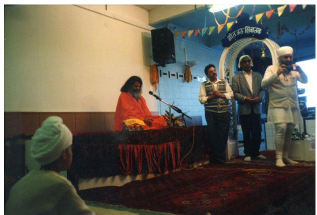
Swamiji in Hindu-Temple Hamburg