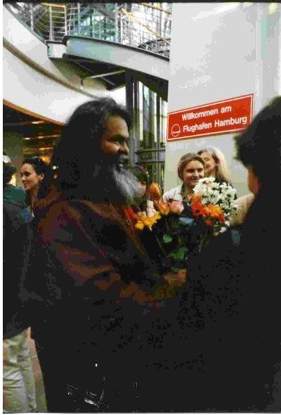
Swamiji on the Hamburg airport